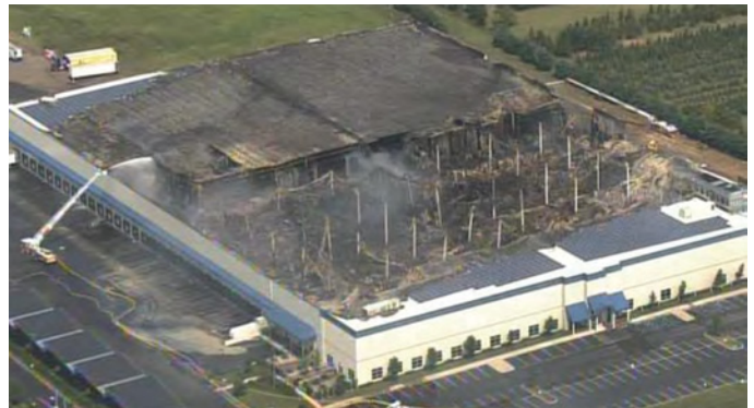
Dietz & Watson in Delanco, NJ

Delanco, New Jersey, US in September 2013: a fire occurred at a cold-storage food warehouse that was approximately 300,000 ft 2 (28,000 m 2 ) in size with more than 7,000 PV modules covering most of the roof. Reportedly, combustible roofing insulation was ignited and allowed the fire to spread. The large PV module array inhibited the ability of firefighters to control the fire. The fire took more than 24 hours to suppress and the building and contents were completely destroyed.