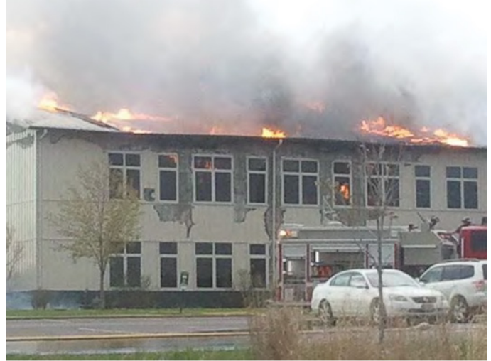
Organic Valley in La Farge, WI

La Farge, Wisconsin, US in May 2013: a fire occurred at the corporate headquarters of an agricultural cooperative for organic food. The fire started inside the building and spread to a concealed attic space. The building's sprinkler system was not effective at controlling the fire. At some point in the fire development, the metal roof became energized by the PV system, which inhibited suppression activity by the fire department.