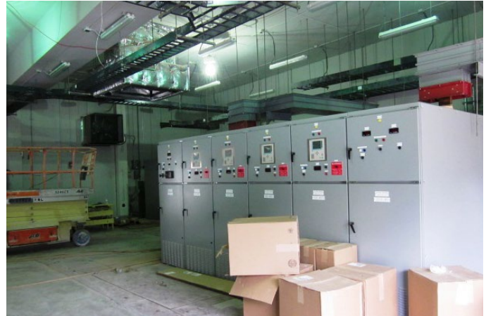
When hot-testing equipment, always have a written commissioning plan

PROTECTING EQUIPMENT IN SUB-CONTRACTOR CARE Note that it is important for the contractor to ensure proper handling and care of equipment by the subcontractor. Often contractors do not consider the protection of equipment while offsite and in the subcontractor's possession a project exposure, however, this is often an incorrect assumption. Many losses to contractor equipment occur while in the custody of the subcontractor or stored offsite. With long-lead equipment, such losses can delay project completion, resulting in a costly loss and owner dissatisfaction.