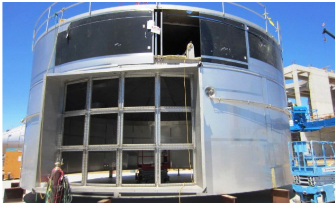
Take care to develop an appropriate lifting plan for heavy equipment